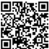
Map to Arts District